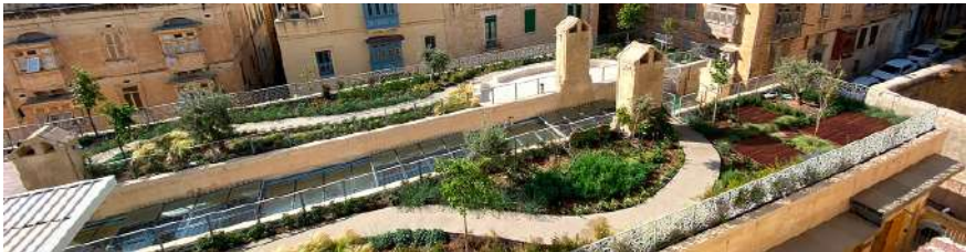
The roof garden of the Valletta Design Cluster, in the heart of Malta's capital city.

our summer school since 2022 as it provides our participants the creative space they need, whilst also giving access to the busy heart of Valletta. During our breaks you will be able to step outside directly onto historical streets with cultural attractions, shops, restaurants and the coast only minutes away. ✨