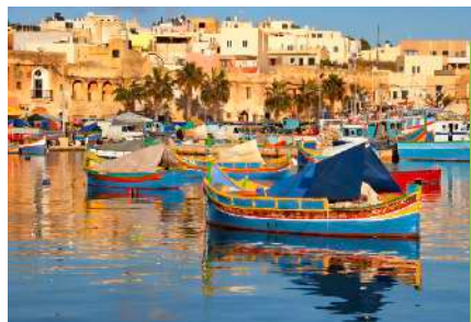
Luzzu boats - traditional fishing boats of Malta.

Malta has a rich history with many rulers, including the Romans, Normans, Knights of St John and the British. In 1964 it became an independent state and it joined the EU in 2004. The official languages of Malta are