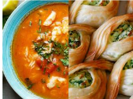
Aljotta (left), a fish stew and pastizzi (right).

And if you're looking for night-life you won't need to go very far as the coast is packed with bars, pubs and clubs that are great for casual socialising. We recommend checking Facebook for daily events such as live music, open-mic nights, stand-up comedy, karaoke and more. For the more intense