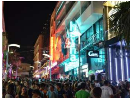
Paceville is Malta's prime spot for nightlife.

clubbing experience you can try Paceville, Malta's nightlife hub and a destination for many tourists and party-goers. ✨